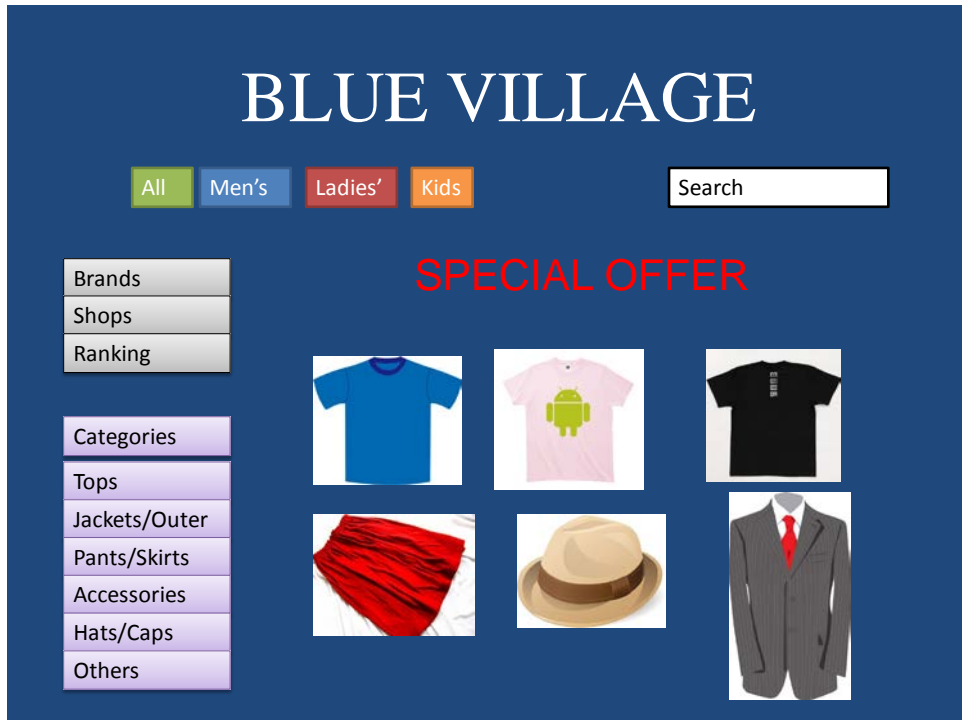
Top page of Blue Village (for illustration only)